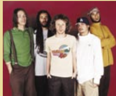
Outspoken Surfrider Foundation supporters, Incubus.

They may seem like tough guys with their tattoos and disheveled hair, but more and more, when it comes to protecting our beach and ocean environments, many of music's top rock acts are proving that they too have a soft spot.